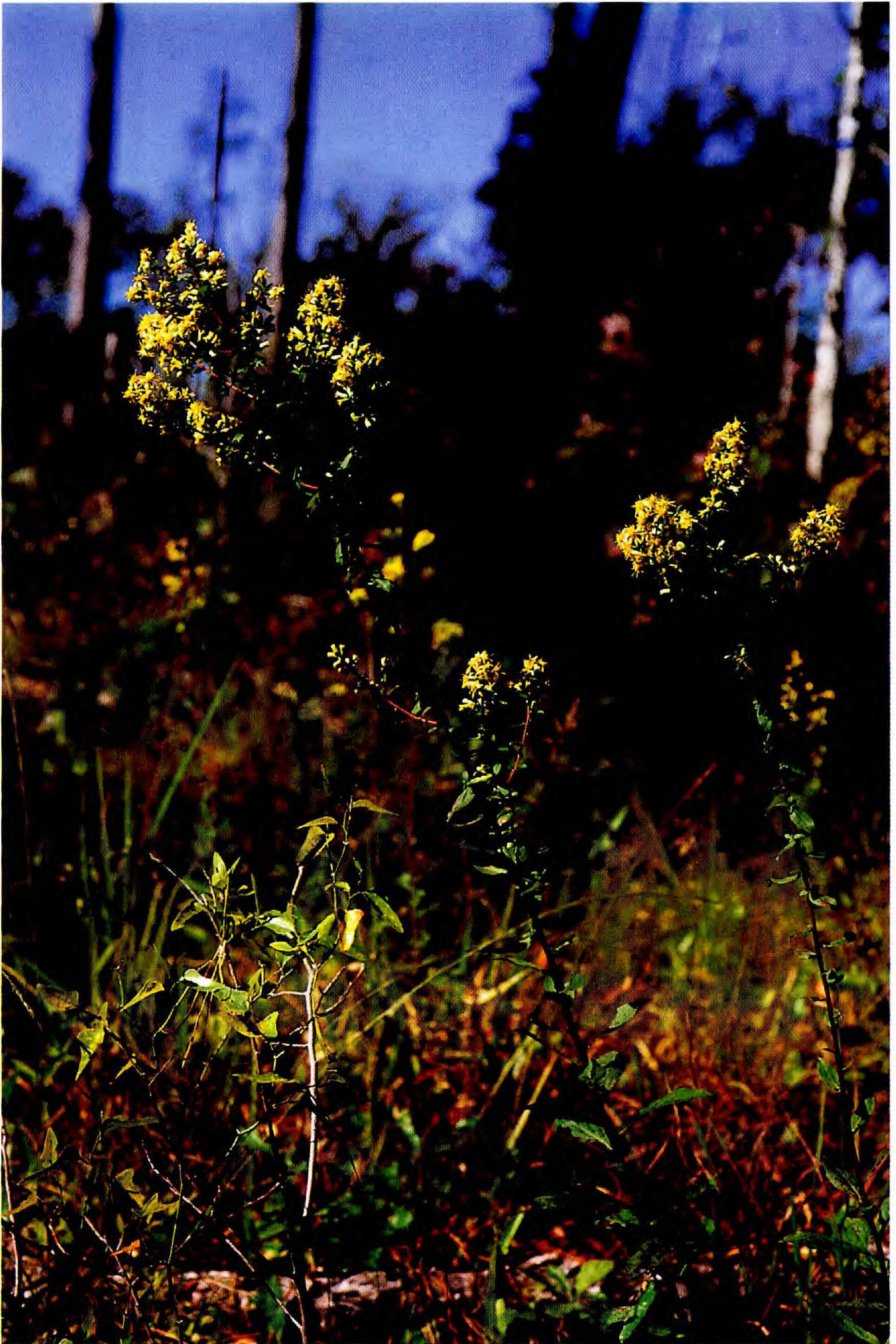
FIG. 2. Solidago villosicarpa LeBlond. Habitat showing example of paniculately branched thyrses.